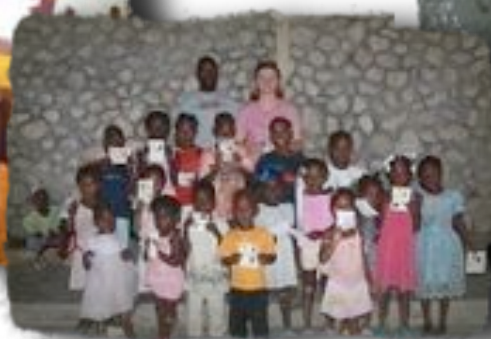
The children looked forward to children's church each day.