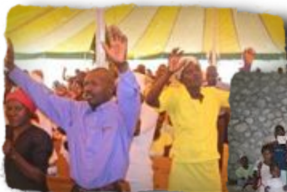
God anointed every service! God's wonderful Holy Spirit visited with us!

Non-Profit Organization U.S. Postage Paid Clay City, KY 40312 Permit No. 12