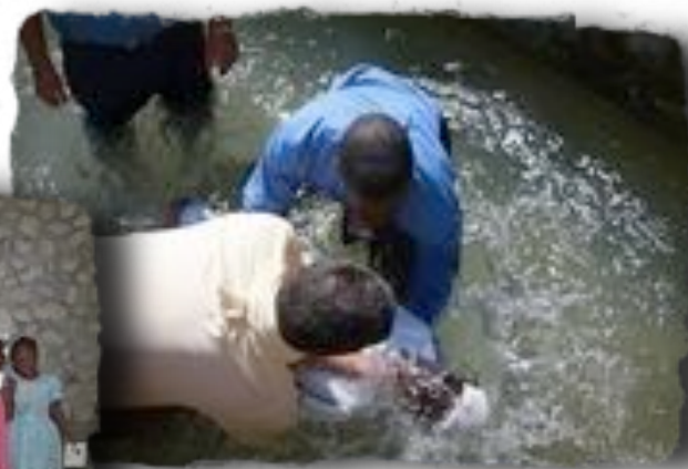
The people rejoiced as they were baptized.